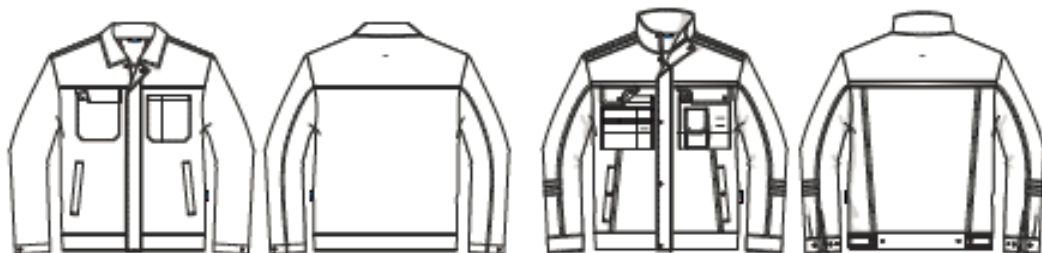
PRODUCT VERSION: - 0014 (updated for Standard)