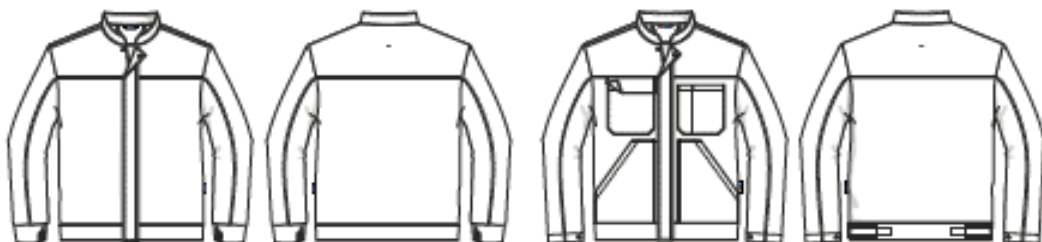
PRODUCT VERSION: 4001-17 - Low stand collar, no side panels - VCU04 at sleeve end