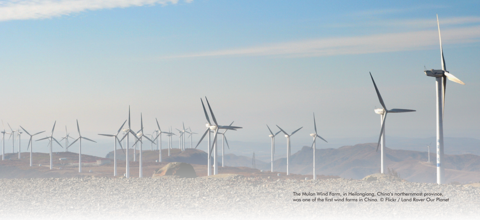
The Mulan Wind Farm, in Heilongjiang, China's northernmost province, was one of the first wind farms in China.