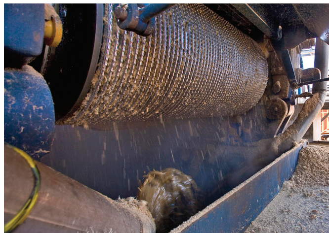
Sugarcane stalks are crushed at a mill in Brazil to extract sucrose, which is then refined to make sugar, ethanol or other products.

SEI is a major partner in the Global Commission for the Economy and Climate and its flagship research project, the New Climate Economy ( www.newclimateeconomy.net ), in which SEI leads the energy transition work package. The project aims to provide independent and authoritative evidence on the relationship between actions to strengthen economic performance and to reduce climate risks. The premise, consistent with the findings of