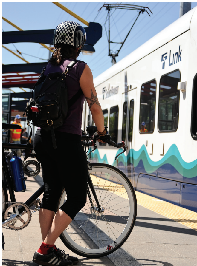
Seattle and Washington State have worked to reduce transport-related emissions by improving public transit options and encouraging cycling.

The International Energy Agency has warned that if we are to meet the 2°C target, about two-thirds of the world's proven oil, gas and coal reserves must be left undeveloped, and many financial institutions have begun to explore the implications for markets of having “unburnable carbon”. Still, massive new investments continue to be made; according to the IEA, enough