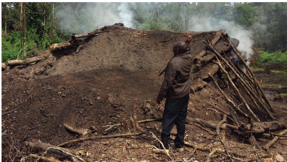
A traditional earth kiln, which can produce 60 bags of charcoal at a time, near Nyakweri Forest, Narok County.

For both wood conversion and cooking technologies, sustained use is a critical element for achieving sustainability. Organized group production, as is provided for under the CPA system, can accelerate the adoption of these technologies. Before installation, it is important for the CPA to get the information the producers will need on wood resource availability and distribution, as this will guide the location of the kilns. The kilns themselves need to be durable, easy to handle, and able to withstand high temperatures. 24