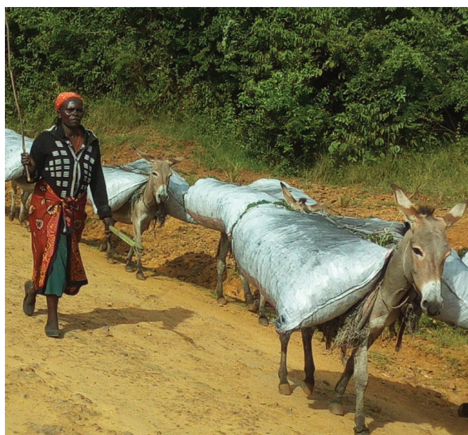
A woman transporting charcoal to Kilgoris town, Narok County.

There are still big improvements to be made in the legal charcoal trade as well. Most county governments have yet to adopt charcoal legislation, even though they have a key role to play in implementing national policies under Kenya's new devolved government system. Access to finance remains a major challenge for CPAs, and producers need significantly more capacity-building.