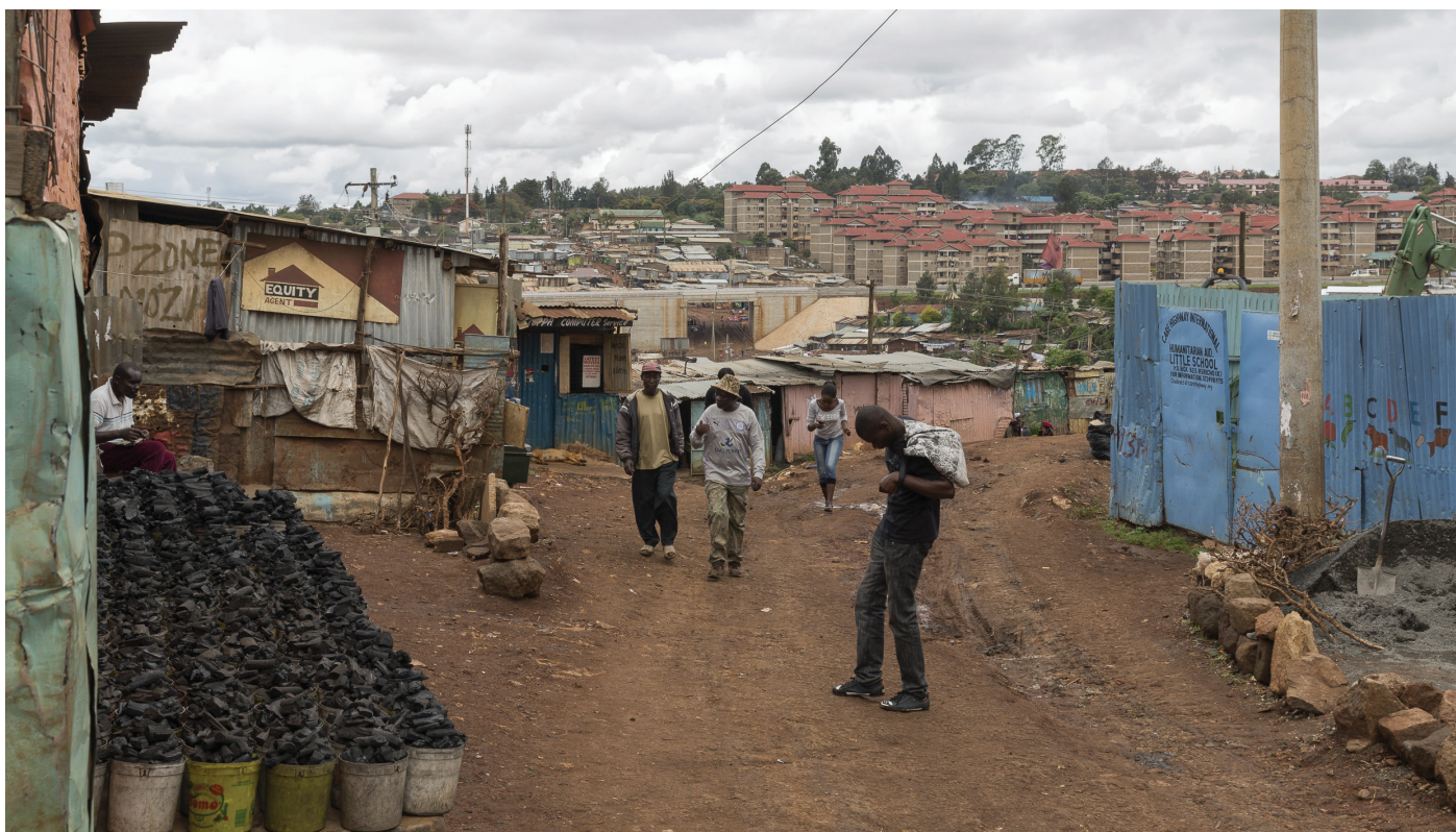
Charcoal for sale in the Kibera slum in Nairobi.