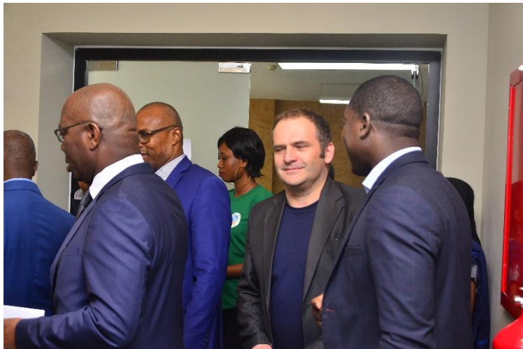
Figure 11: Workshop participants interacting during the coffee break.