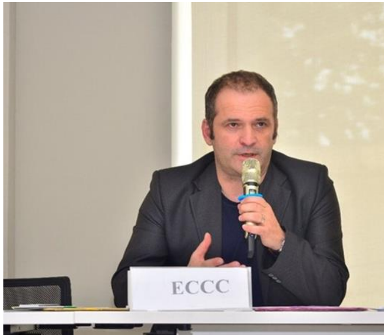
Figure 3: Franck PORTALUPI, Environnement Changement Climatique Canada.

To support the implementation of the project, the Government of Canada, through Environment and Climate Change Canada, allocated financial resources to UNEP which in turn partnered with SEI to support project implementation.