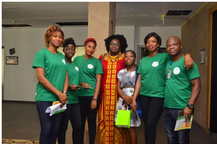
Figure 12: ONG Page Verte team.