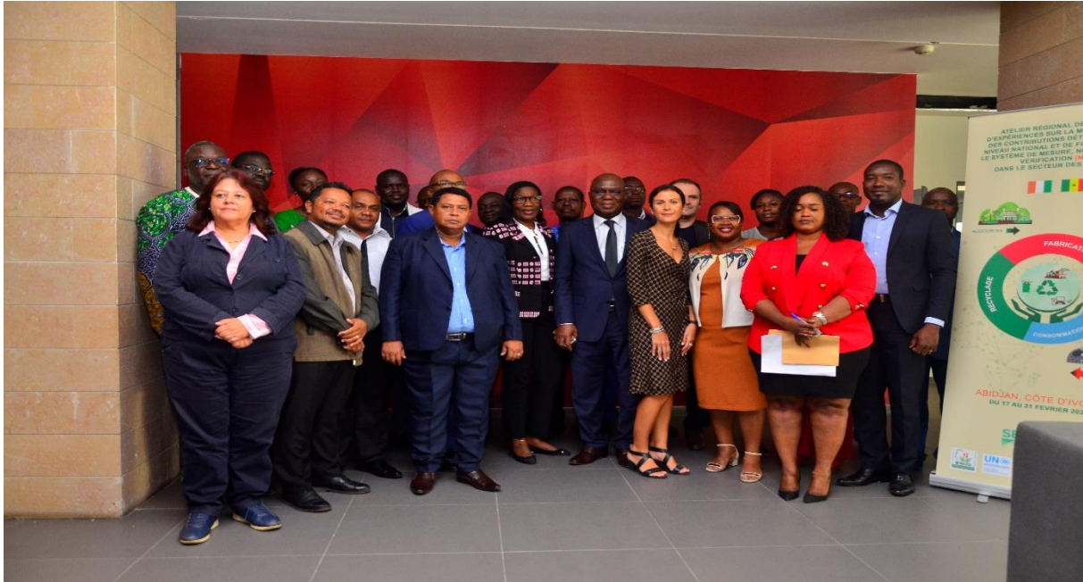
Group photo: Regional workshop participants.

17-21 FEBRUARY 2020, ABIDJAN, COTE D'IVOIRE