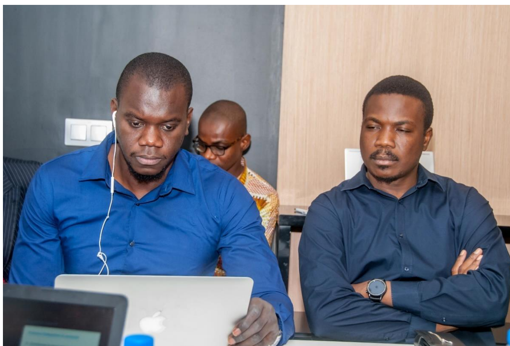
Figure 13: National NDC experts attending the MRV training.