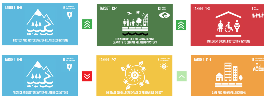
Figure 2. Illustrating ripple effects through the network of targets

Network analysis shows that Target 6.6 makes an even larger contribution to the 2030 Agenda than is seen at first glance, due to positive ripple effects (top row): progress on protecting and restoring water-related ecosystems (Target 6.6) contributes to climate adaptation (Target 13.1), which in turn has a positive impact on the implementation of social protection systems (Target 1.3). Conversely, heavy reliance on hydropower as a source of renewable energy might mean that progress on Target 6.6 would conflict with Target 7.2 (increasing the share of renewable energy), and thus hinder Target 7.2’s positive influence on other targets such as 11.1 (safe and affordable housing).