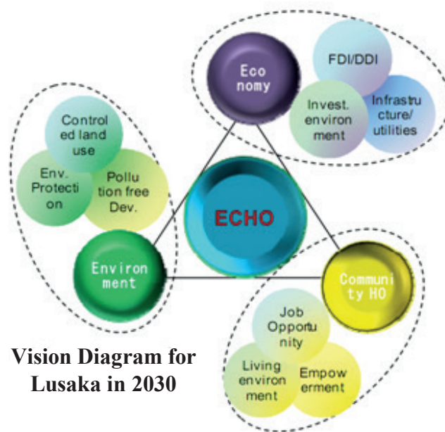
Source: the Lusaka Master Plan