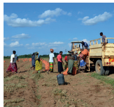
Zambian farmers load potatoes into a truck. Climate change is likely to lead to longer dry spells that may force difficult choices over how to use water resources in Zambia.