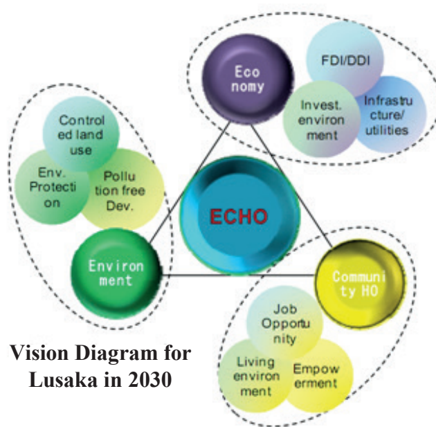
Figure 2. The Lusaka ECHO vision

Overall, energy in Zambia is an important tool for development, both economically as an export, and socially as a utility. However, electrification initiatives involve raising tariffs, and, potentially, the burning of large amounts of fossil fuels.