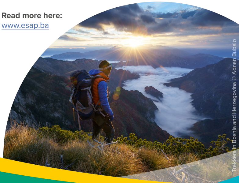
Trekker in Bosnia and Herzegovina