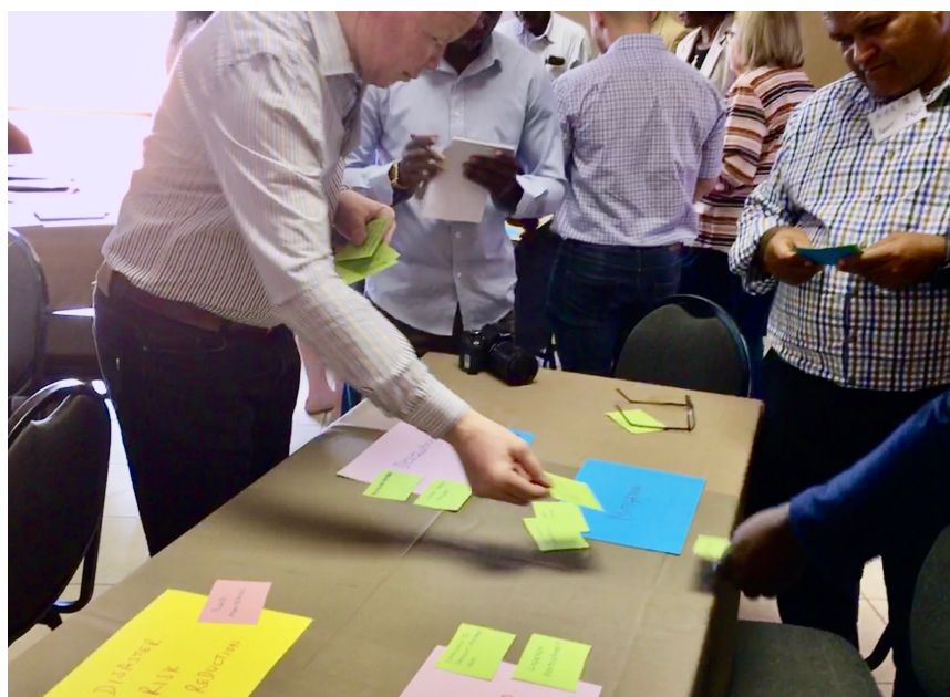
Right: Windhoek city stakeholders considering the statements/actions on their cards.