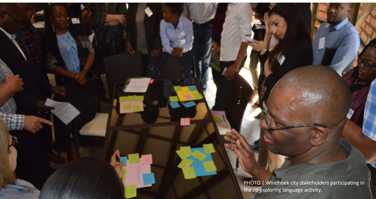
PHOTO | Windhoek city stakeholders participating in the co-exploring language activity.