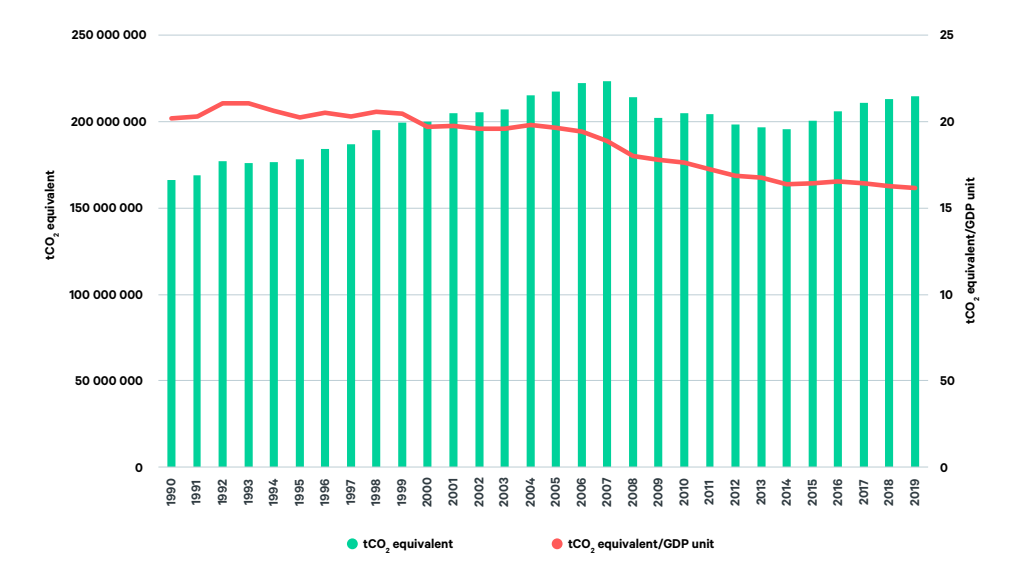
Figure 1: Emissions (t CO2eq) and emissions per gross domestic product (GDP) for heavy-duty trucks and buses in the EU-27, 1990–2019.

The EU adopted the first ever CO_2 emission standards for heavy-duty vehicles in 2019 with Regulation (EU) 2019/1242. The fleet-average type-approval targets imposed on manufacturers are expressed as emissions reduction for new truck registrations in a calendar year compared to EU average for a reference period (1 July 2019 to 30 June 2020) and are formulated as follows: