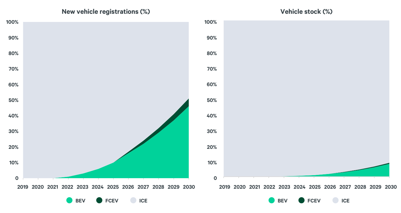
Figure 4: Estimated share of new vehicle registrations and vehicle stock, 2019–2030. Historical data from ACEA's statistics and polynomial growth (order=2) is assumed for new registrations. Hybrid electric and plug-in hybrids are included in the share of BEVs.