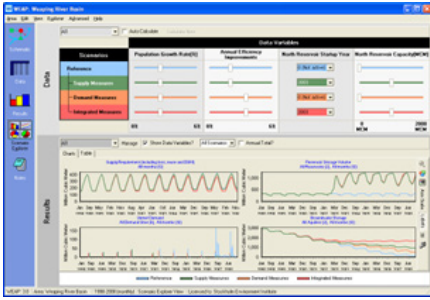
WEAP screen